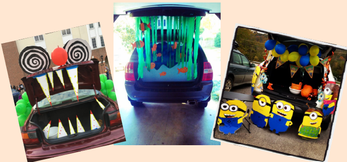
Prize for the BEST Trunk!!