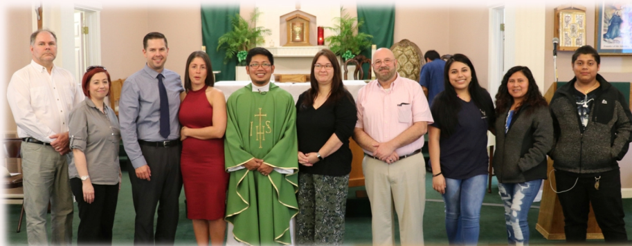
Rite of Christian Initiation